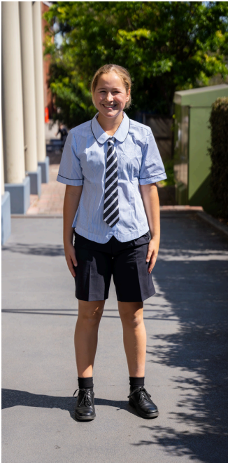
Tailored Shorts Option (Terms 1 and 4)