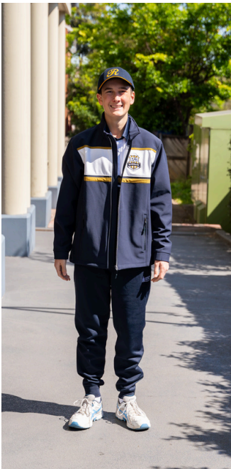
Tracksuit Jacket and Heavy Weight Tracksuit Pants