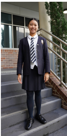
Tights option with skirt (Winter)