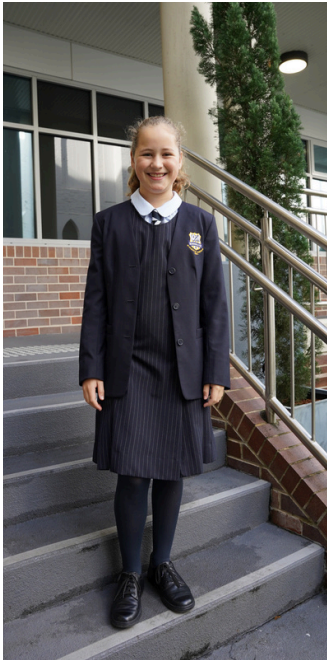
Pinafore (Winter) with tights