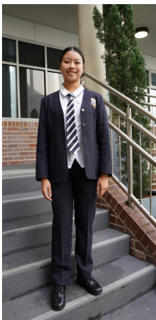
Pants Option (All year)