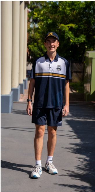
Boys Classic Polo Shirt and Classic Shorts