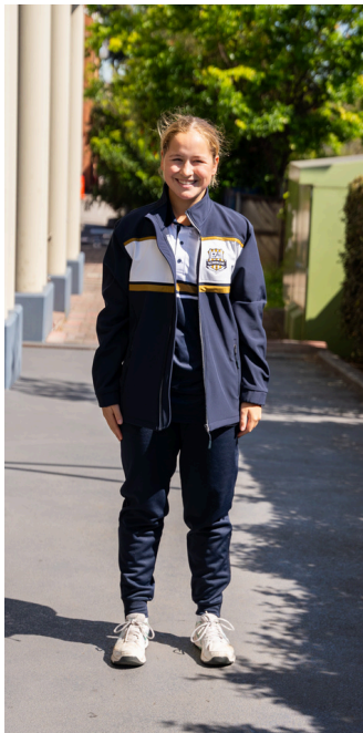
Tracksuit Jacket and Heavy Weight Tracksuit Pants