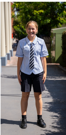
Tailored Shorts Option (Terms 1 and 4) Note: Middle School Girls blouse shown in this photo