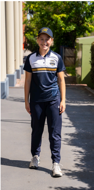
Tailored Polo and Light Weight Tracksuit Pants