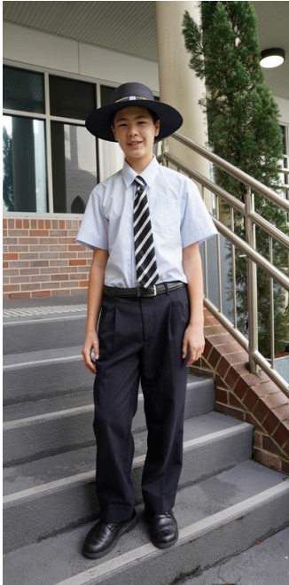
Trousers (All year)