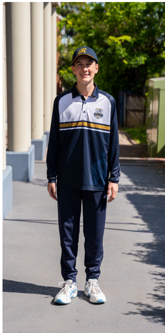
Long Sleeve Polo and Light Weight Tracksuit Pants