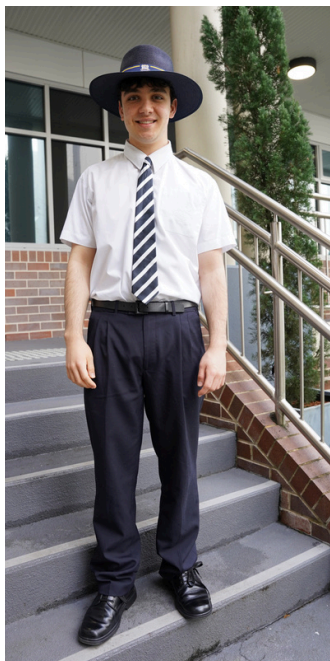
Trousers (All year)