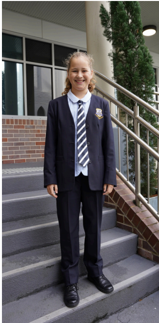
Pants Option (All year)