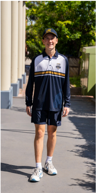
Long Sleeve Polo Shirt and Classic Shorts