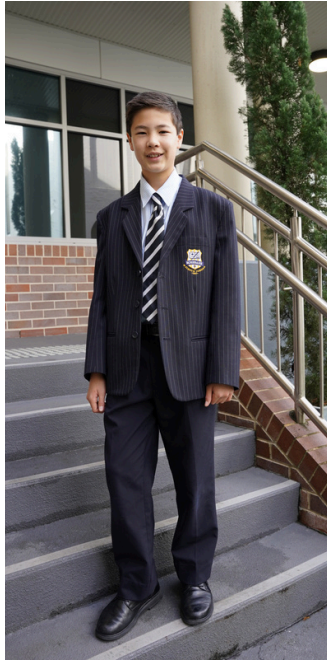
Blazer (All year)