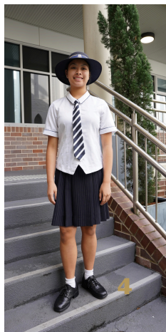
Skirt (All year)